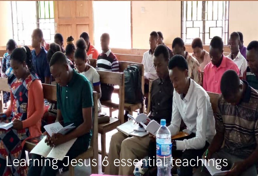
Learning Jesus 6 essential teachings