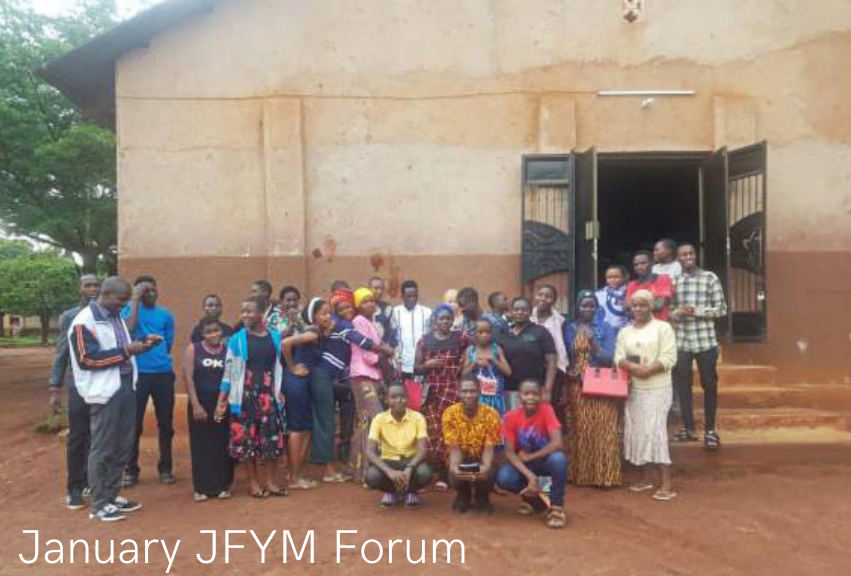
January JFYM Forum