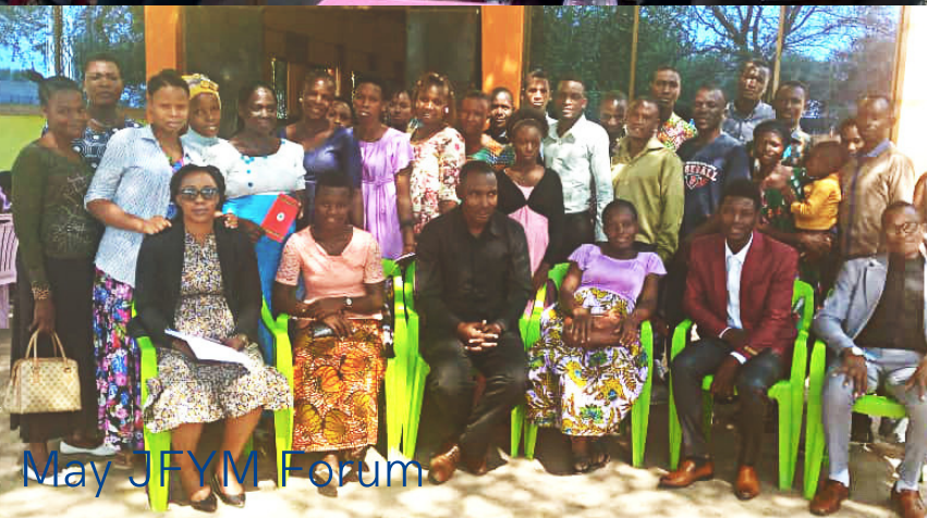
May JFYM Forum