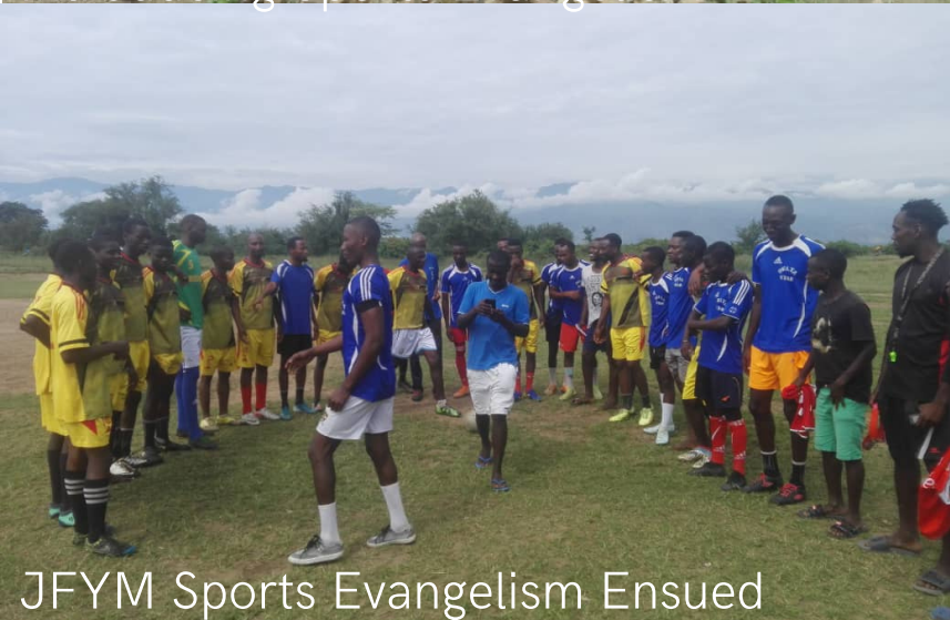
JFYM Sports Evangelism Ensued