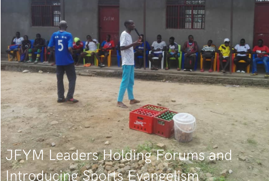
JFYM Leaders Holding Forums and Introducing Sports Evangelism