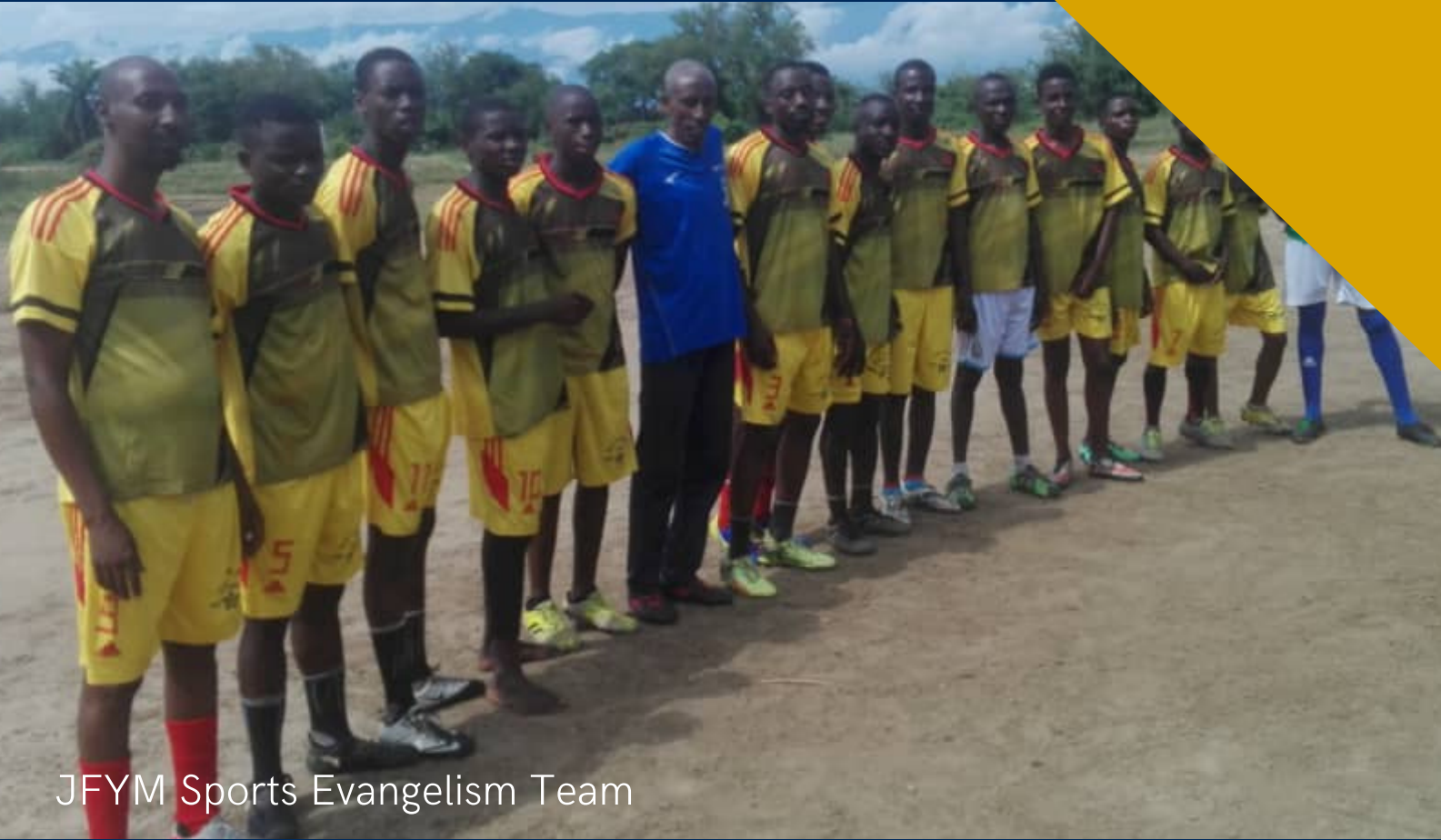
JFYM Sports Evangelism Team