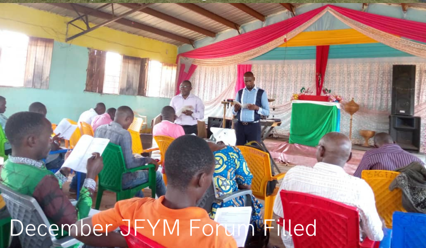
December JFYM Forum Filled